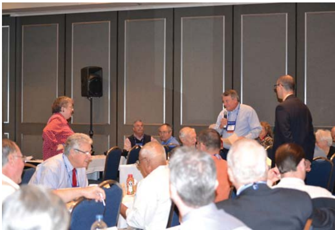
Fall 2011 Conference in Anaheim, CA - Attendees participate in a group exercise during the JPIA's seminar, Keeping Things on Track When Folks are Rude, Crude, or Confused.

sistant in the Near East South Asia Bureau. In that position she supported Henry Kissinger's shuttle diplomacy in the Middle East and supervised the flow of reporting and memoranda for other hot spots in the region.