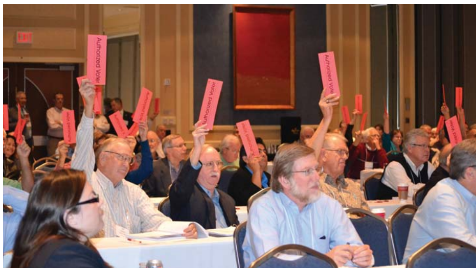
Directors voting during the fall 2011 JPIA Board of Directors' meeting held in Anaheim.

The JPIA's Risk Management and Executive Committees also conducted meetings during this conference.