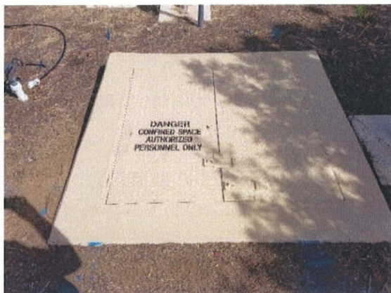
Before Opening the Vault.