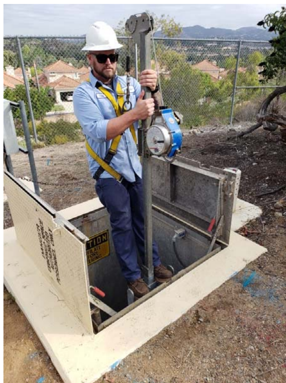
Entering the vault