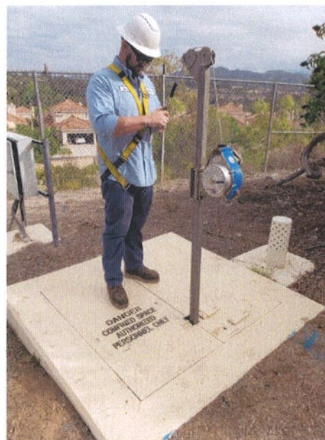
Illustrates the fall hazard is eliminated.