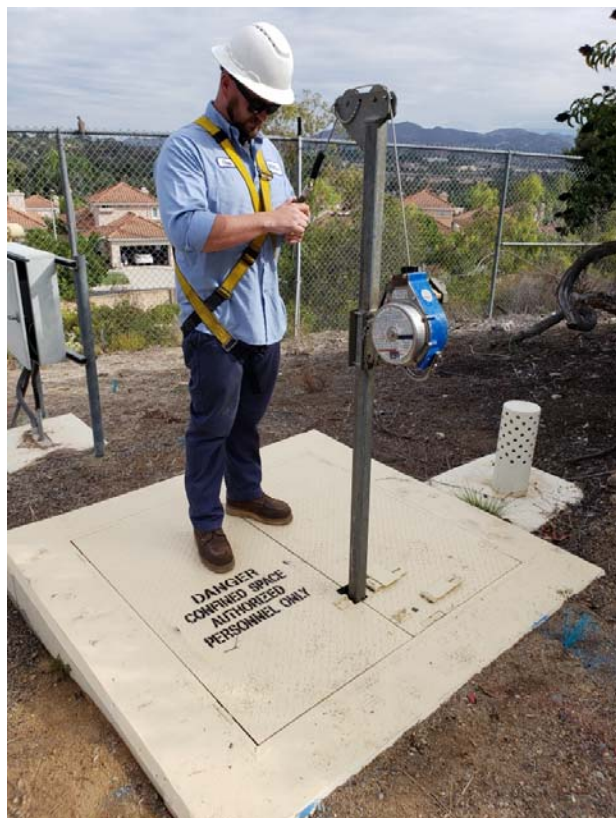
Fall Protection Vault