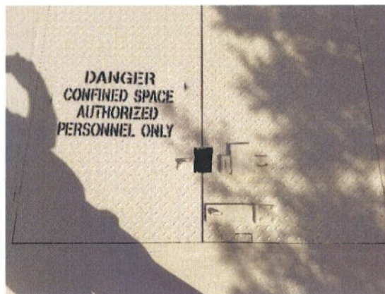
Small Opening to access the fall protection receiver.