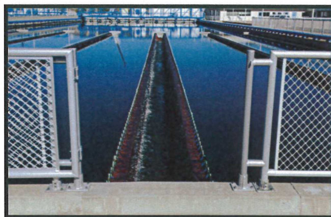
New Gate Open