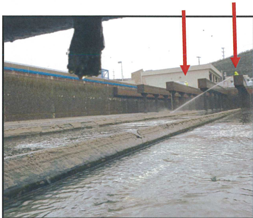
Staff Working from Launderers