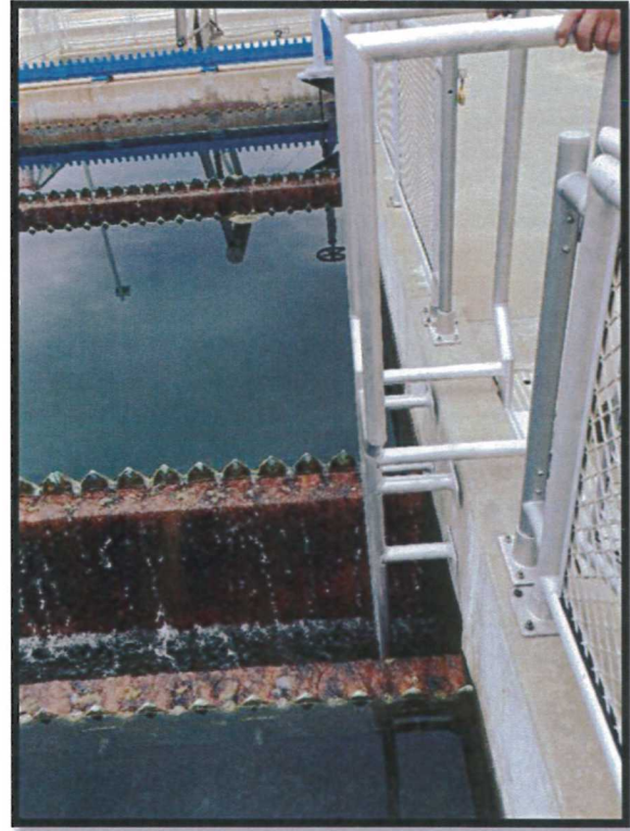
Ladder Assembly in Place and Secure