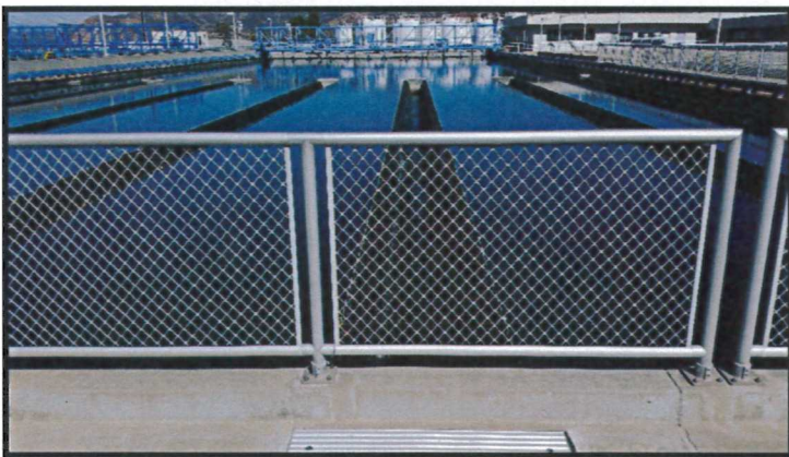
Original Guardrail Panel in Front of Launder