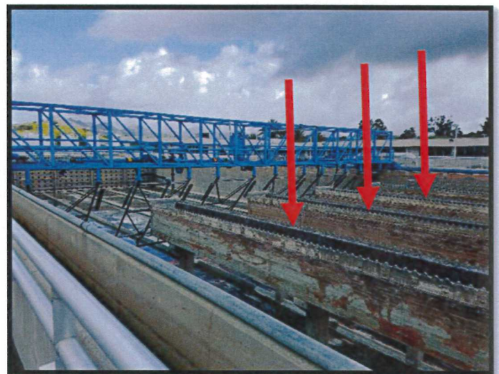
Empty Basin - Launder Approx. 15' Above Concrete Basin Floor