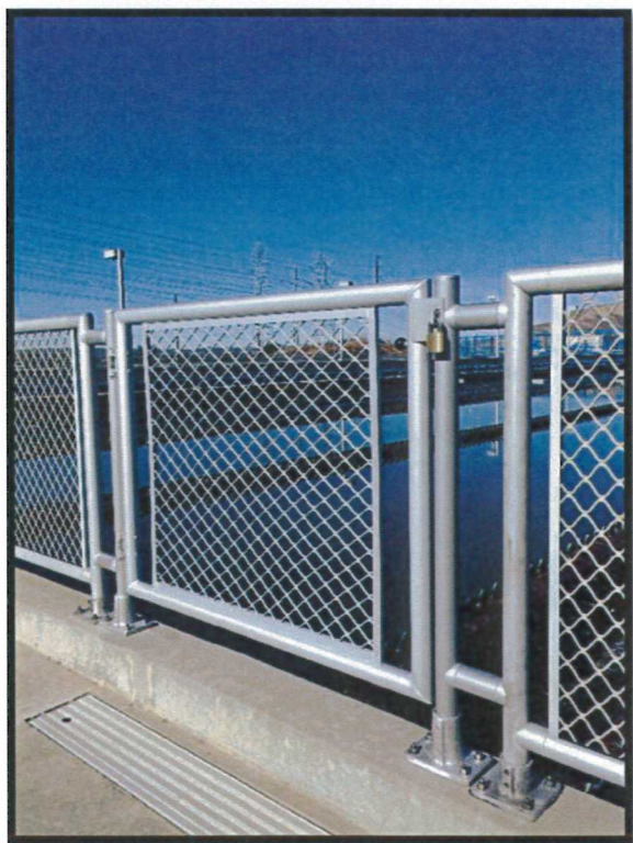
New Gate Closed with Lock