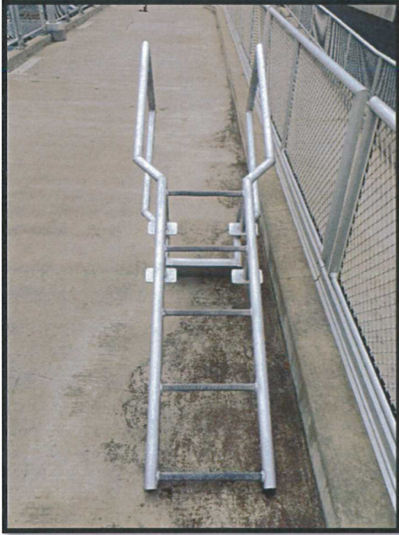
Custom Portable Ladder With Handrails