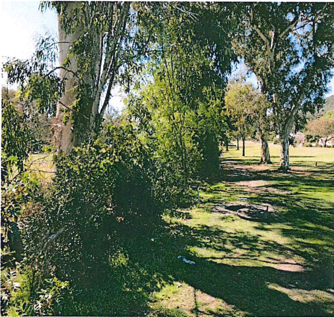
MNWD P.R. Facility located on golf course between the Driving Range and Fairway.

In conclusion employees can now work on the golf courses without the risk of being struck and injured by golf balls.