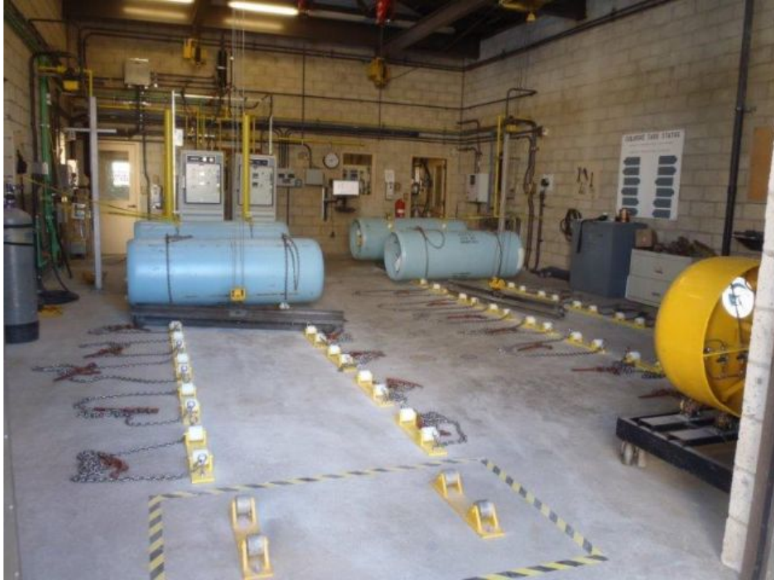
After rolling trunions installed