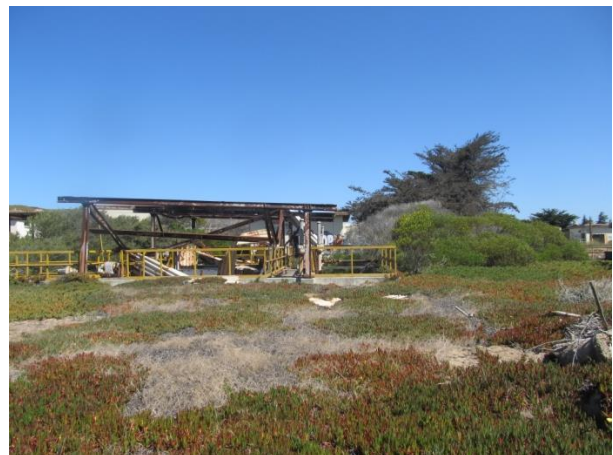
Photos 5 & 6 – Ice plant growth covering underground boxes and vaults throughout Old Ord Plant