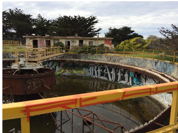
Photos 3 & 4 – Abandoned Old Ord Plant facilities including unsecured access to confined spaces and vandalism