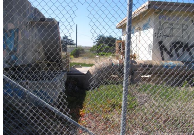
Photos 1 & 2: Lone operational equipment and damaged fence at Old Ord Plant