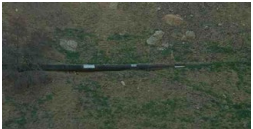
Pipeline inspection in hard to reach areas.