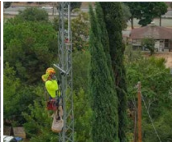
Training and Public Outreach