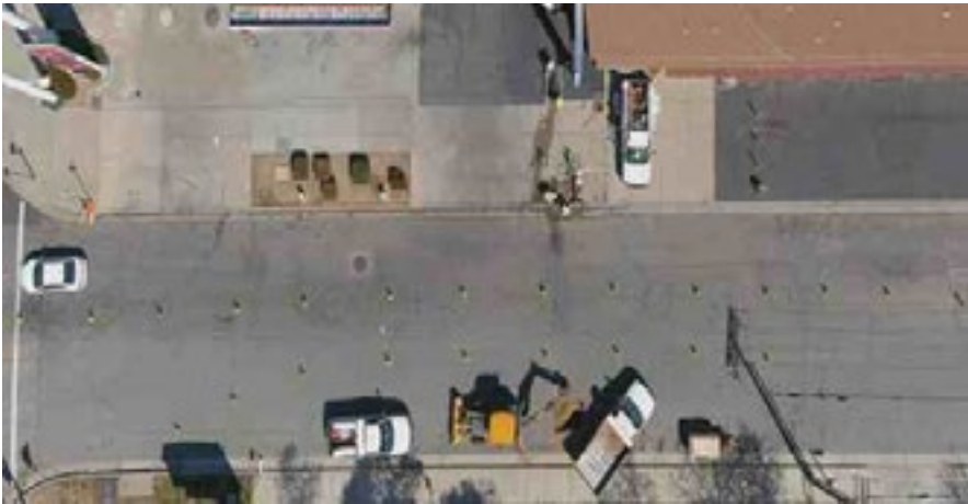
Traffic Control Training - Crews repairing a leak