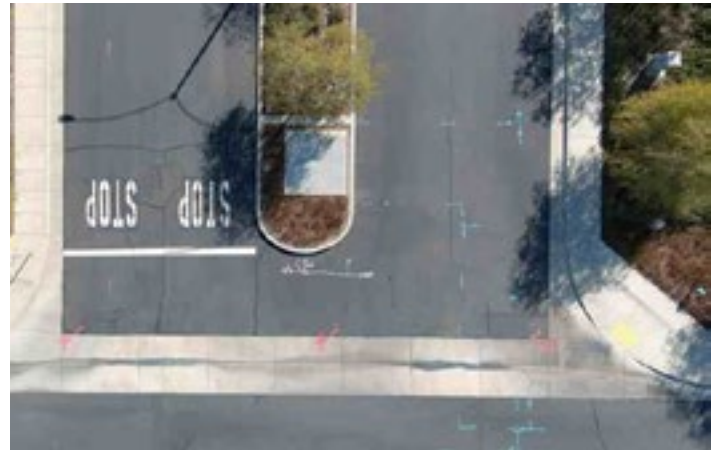
Documenting USA locating